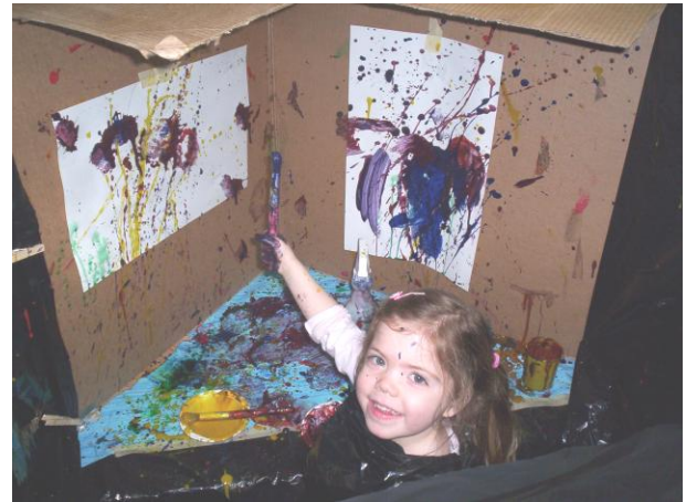
Splatter painting in Preschool 1 Woo hoo! What a mess!