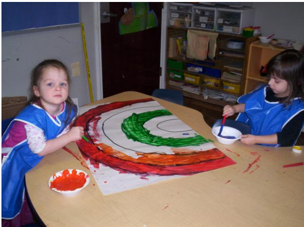
Nursery Schoolers work together to create a rainbow (our "color" of the month in March).